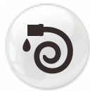
WATER HOSE AND SUBMERSIBLE PUMP