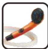
Shower head and hose assembly