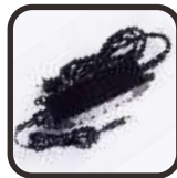
120/220VAC - 12VDC charge adapter