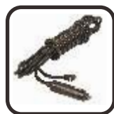
12V DC lead cigarette connector