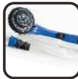
Shower head and hose assembly