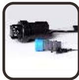
Water hose & pump