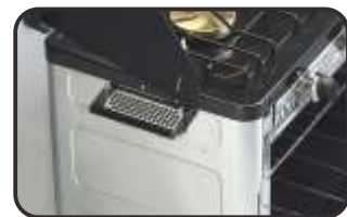
Protruding type handle