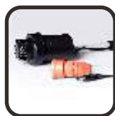
Water hose & pump