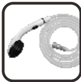
Shower head and hose assembly