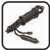
12V DC lead cigarette connector