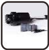
Water hose & pump